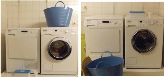
Figure 2. Left: The spatial layout of the eight learning sessions and four follow-up sessions. Right: the altered spatial layout for the session with a different spatial layout.

whether patients with Korsakoff's syndrome were still able to perform the instrumental activity. The goal of the second to the fourth follow-up was to examine whether patients were able to improve their performance on the instrumental activity. In the fifth follow-up assessment, the spatial layout of the procedure was changed such that patients performed the task in a washing room with a different spatial layout (see Figure 2). Only one follow-up assessment included a changed spatial layout to minimise the possible discomfort involved with performing the task in a different set-up. During each session, the participant learned the laundry task using the schedule presented in Table 1.